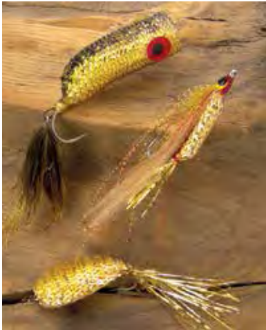
Light weight and economical make MYN an ideal product for designing and tying fishing lures of all types and sizes. Several world records have been set with lures constructed with Techflex sleeving.