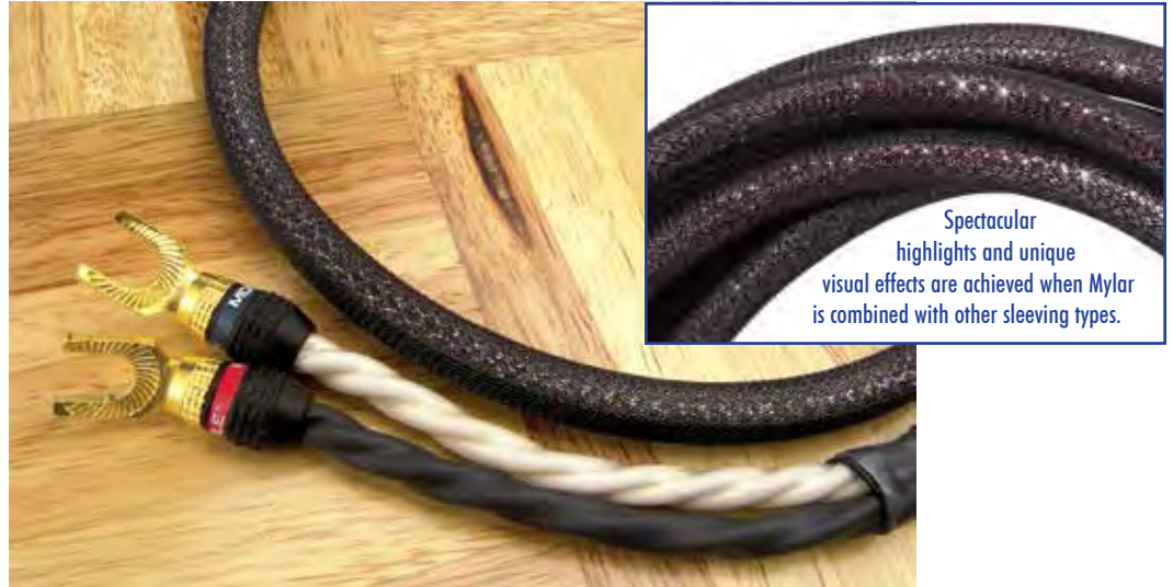
Spectacular highlights and unique visual effects are achieved when Mylar is combined with other sleeving types.