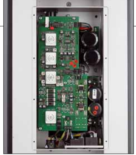
As far as sound, dynamics and operational safety is concerned the electronics unit of the MSMs1 is beyond all doubt.

Except for the switching and volume control of the sound sources no further amplification electronics are needed. Balanced outputs should be available, though. And then the choice is yours: The studio technology can be configured in many ways. Treble adjustment, equalization at 3 kHz in silk screen mode, bass correction, high pass filter for AV applications, polarity, input sensitivity – you name it! We recommend to leave everything in center position in the beginning. With this setup the MSMs1 already sounds brilliant and the desire for changes will evaporate into thin air immediately. Right from the start the loudspeaker offers incredibly natural voices and instruments, completely smooth and realistic. A piano sparkles with perfect timing, a guitar vividly scampers through the room, strings gently float around your head and a percussion section cracks and bangs inimitably. Each voice is a gem that glows