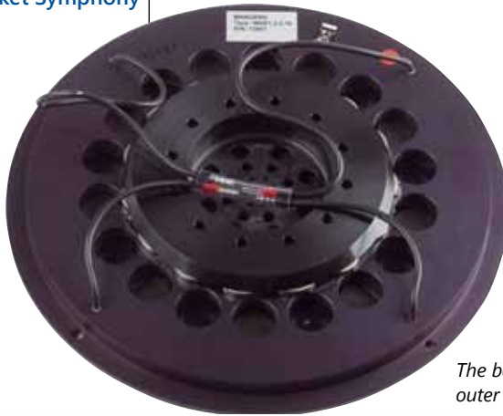
The back panel of the MSW is connected to the outer world via numerous openings.

This goes for the bass range, too. Sufficiently low, but very dry and tight. And the subtleties are a revelation: In its closed cabinet the woofer clearly depicts the tonal differences of various drums and recordings without limiting its dynamics which are excellent, anyway. The MSMs1 handles high volume levels very well and seems